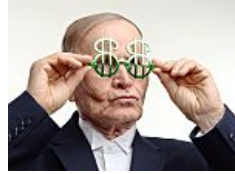
How To Use Credit Cards Like The Rich (NextAdvisor)