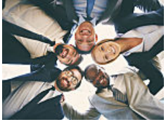
1 Dirty Little Secret To Eliminate 15 Years Of... (LowerMyBills)