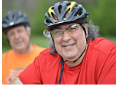
Living Bold With Diabetes (HealthCentral.com)