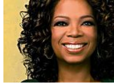
11 Most Politically Active Celebs (Suggest)