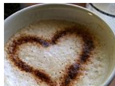
How Caffeine Affects Your Heart (HealthCentral.com)