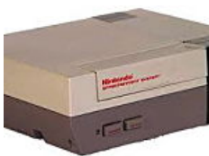
20 NES Games Worth Blowing The Cartridge For (RantGamer)