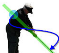
Golf Game Slipping? This Swing Fix Is Helping... (Graves Golf)