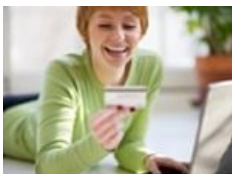
7 Credit Cards That Rank As The Best For Those... (NextAdvisor)